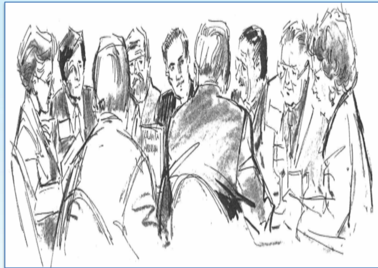
Sketch of a GSC session in 1995