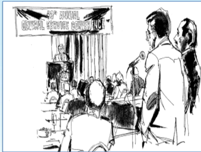
Sketch of a GSC session in 1993

Because of strong sentiment against any changes in the first 164 pages of the Big Book, the request to rewrite the first three chapters of the Big Book not be implemented.